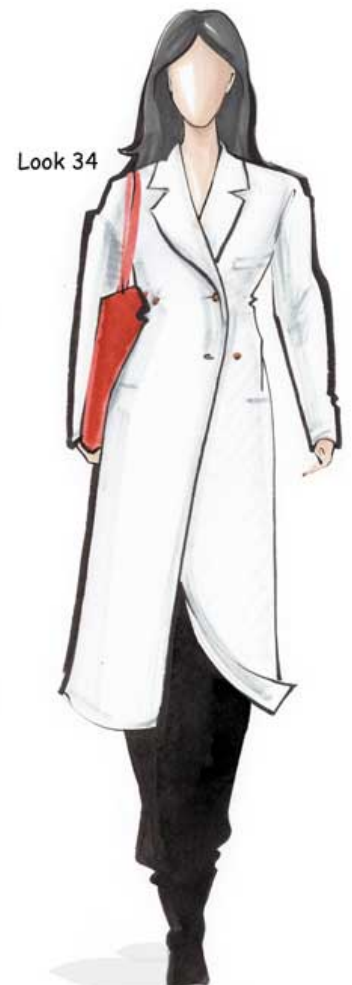
Celine A/W 17